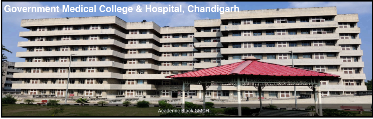
Academic Block GMCH